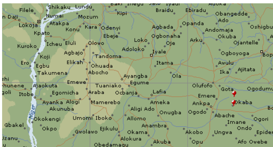
Figure 2: Map of Kogi State showing the study area marked with thumbnails.

The voltage settings for the analysis of various metals are in the following range: Na→Cl (4-12 V). The optimised voltage used is 8 V. K→V (12-20 V) has an optimised voltage of 18 V. Cr→Co (20-25 V) with an optimised voltage of 25 V and Ni→Ag (25-30) with an optimized voltage of 28 V. Energy dispersive X-ray fluorescence spectrometer is a non-destructive technique which is a key consideration in applications where the sample may need to be re-used.