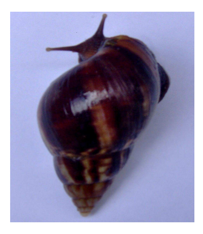
Figure 2: Photo of Achatina achatina . 1431