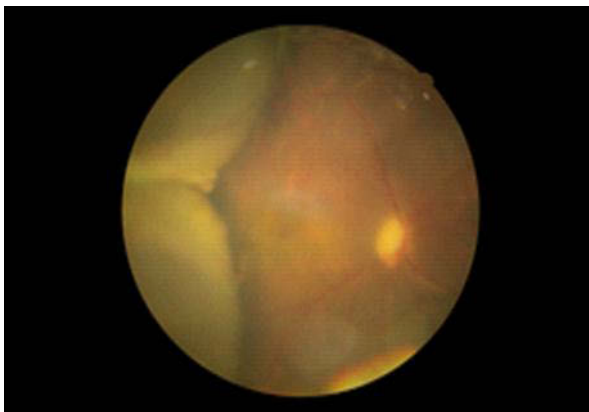
Figure 2a: Fundus picture of the right eye on post-operative day 7 with increased height and extension of the choroidal effusion.

diaphragm back and for some healing around the scleral flap and bleb to reduce the overfiltration. Upon failed conservative management, he had a right anterior chamber reformation with viscoelastic under general anaesthesia on post-operative day 7 to augment the