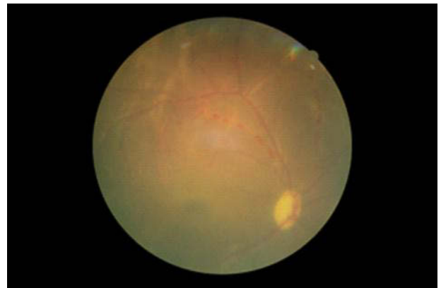
Figure 3: Right eye fundus picture showing resolved choroidal effusion with completely flat retina 1 week post sclerostomy and effusion drainage

At the 11 th day post-trabeculectomy, patient eventually had a right compression suture, repeat anterior chamber reformation with viscoelastic and sclerostomy with drainage of effusion under general anaesthesia.