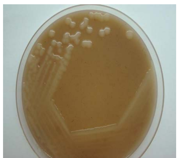
Fig.3: Klebsiella pneumoniae on D & S Simple Medium