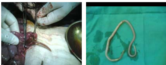
Figures 3 and 4 showing ascaris worm emerging from the small bowel.

The mass infiltrated the bowel. Extensive resection of the mass and part of engulfed ileum was done. After resection was complete and immediately before the anastomosis we saw a worm of ascaris coming from distal part of ileal lumen as shown in fig 3 and 4.