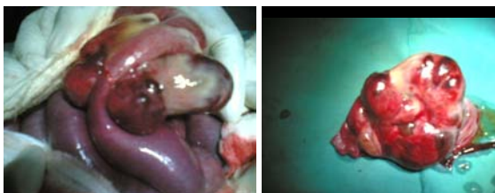
Fig 1 and 2 showing the tumour before and after excision

A 14-years old male presented with a recurrent episodes of sub-acute intestinal obstruction. Clinical examination revealed vague abdominal mass in the left side of the abdomen. Exploration laparotomy showed an extensive mass in the mesentery of the small bowel, causing narrowing of the lumen Fig 1 and 2.