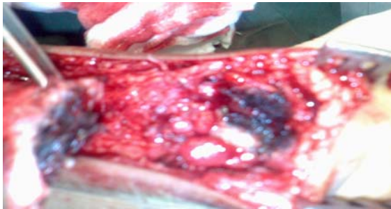
Figure 2: Dull yellow staining with deep black surface of the ruptured Achilles tendon.

At operation it was found that the entire tendon was stained dull yellow and the ruptured surface stained deep black (figure 2).