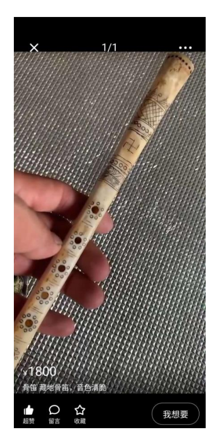
Tibet style beautiful 6-hole vulture bone flute sold on the internet (Jang Kewei)