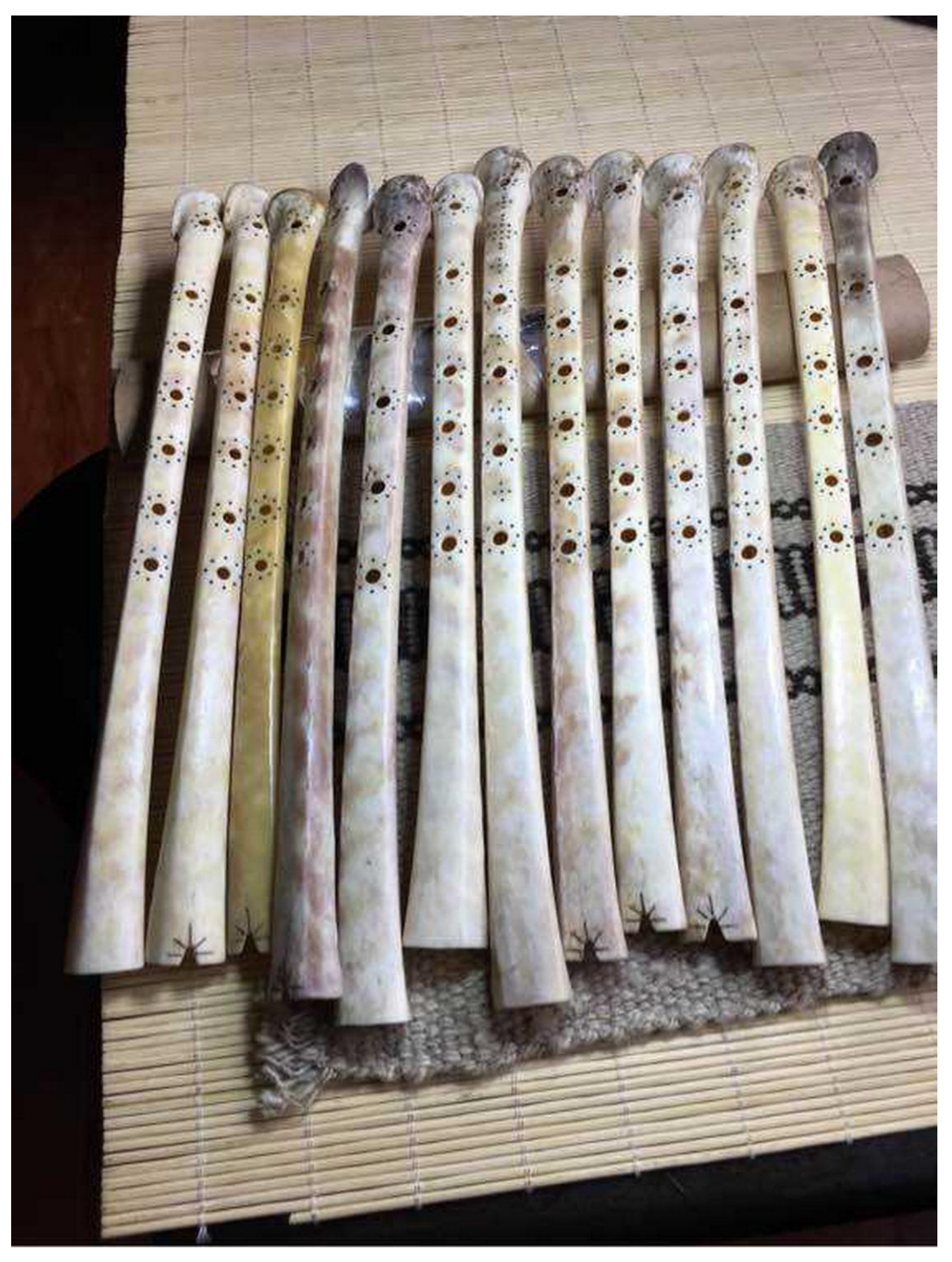
Tibet vulture bone flutes with 6-hole (Jiang Kewei)