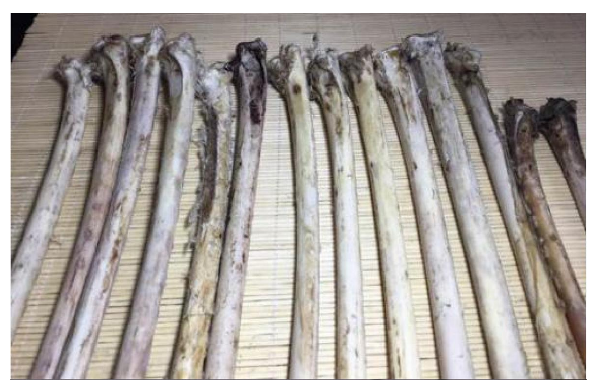
Vulture bone materials from Tian Xiangdong_2019