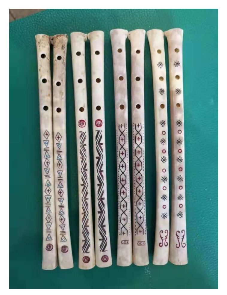
Three hole vulture bone flutes of Tajik nationality, Xinjiang, photographed by Gao Hao, May 2018