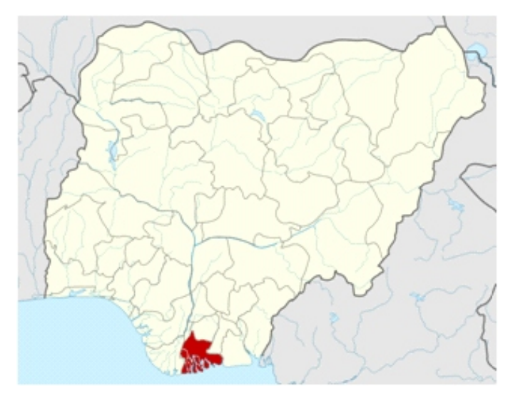
Figure 2: Rivers state marked in red.

Rivers state inaugurated its own Prevention of Blindness committee in December 2008 and published their 5 year eye care plan in 2009. However at the national level, perhaps to a more critical degree, virtually nothing is being done to implement it. Overall prevalence of blindness is 0.8% (3.2% in people older than 40 years) in the state.