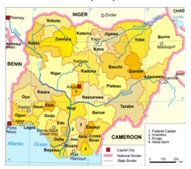
Figure 1:The map of Nigeria

Nigeria whose capital is located in Abuja with an estimated population of 140M has 6 geopolitical zones. The Nigerian Prevention of Blindness Committee (NPPB) now recently changed to National Eye Health Program(NEHP) was set up in 1990 after which the V2020-right to sight initiative was just ratified in October 12, 2000, ten years after. Prior to 2005, there had been no coordinated study carried out at national level. An informal meta-analysis of studies carried out in some areas in Nigeria were all pointing to a national prevalence of blindness of 1%, some 20 years ago, with some areas in the northern parts up to 6.6%.