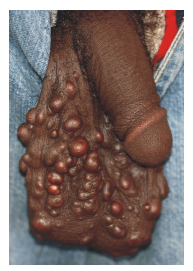
Figure 1. Skin-coloured to yellow papules or nodules ranging in size from a pinhead to several centimeters in diameter

Histologic examination of an excised nodule stained with hematoxyline and eosin showed a thin layer of epidermis overlying a dermal lesion made of multiple cystic spaces of varying sizes. These spaces were distended by large amorphous granular basophilic material consistent with ISC (Figures 2).