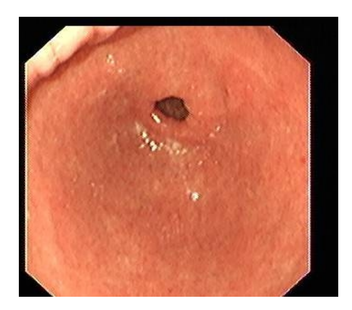
Fig. 6: Follow-up EGD showing the base of of polypectomy site