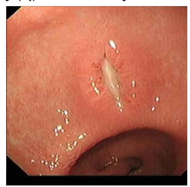
Fig 3: Antral ulcer