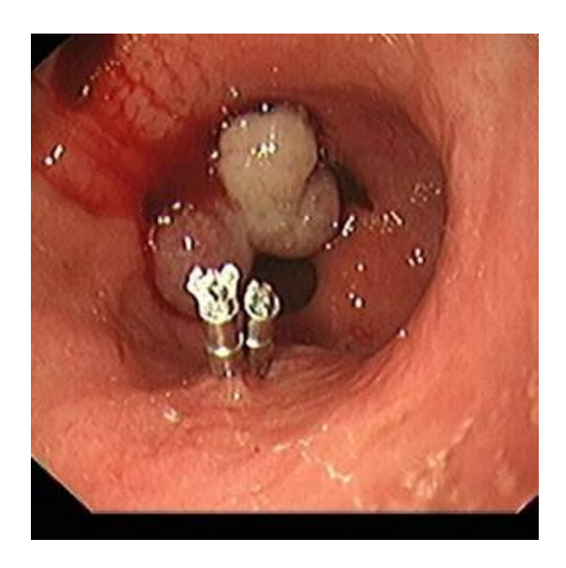
Fig. 4: Polypectomy and application of two clips