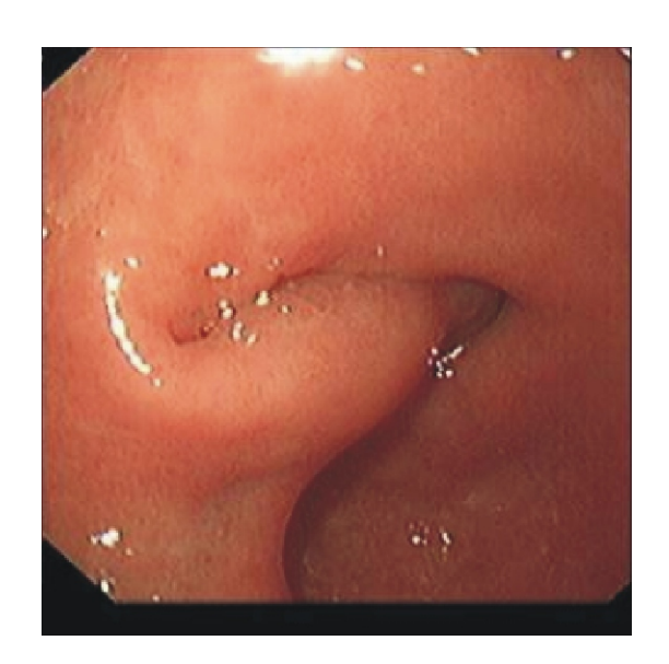
Fig1: EGD showing polyp prolapsing into duodenum