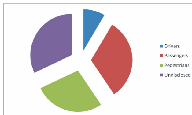
Figure I- Status of patients with nasal trauma.