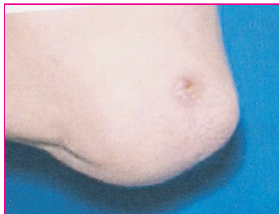
Figure 2 showing a granulomatous lesion on the elbow.