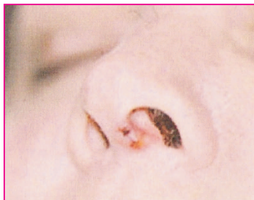
Figure 1 showing ulceration of the nasal septum

control. However the benefits of steroid and other immunosuppressive therapy will not mean much if a proper diagnosis is not reached before the onset of organ damage. Therefore it is incumbent on physicians to have a high index of suspicion when the physical examination and the white cell count are suggestive of CSS and to institute early treatment.