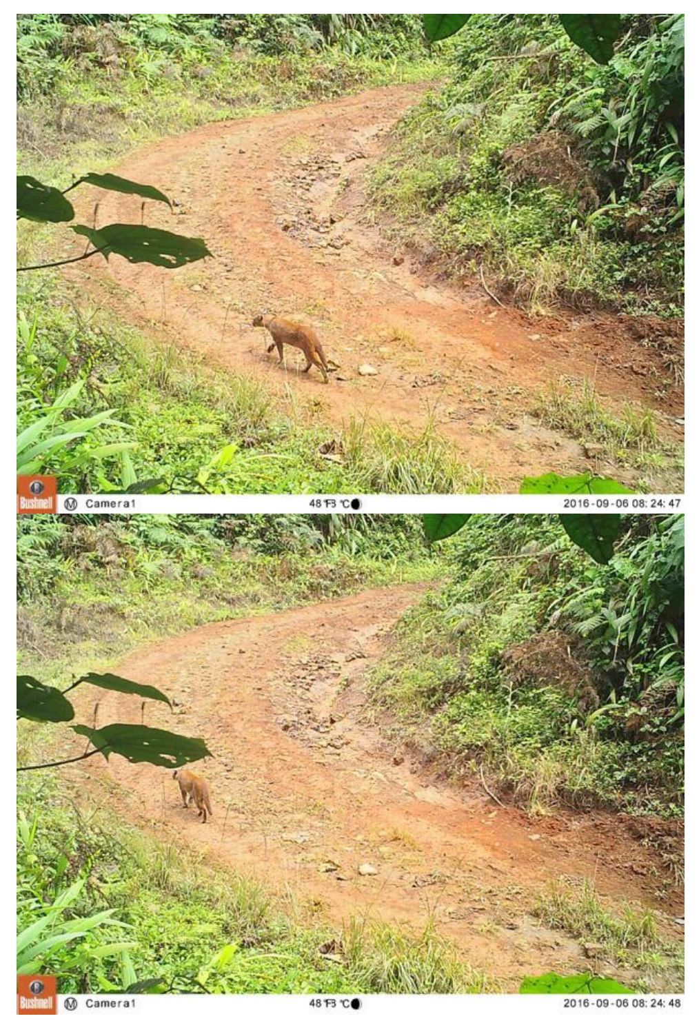
Figure 3. Camera trap images from Kieni Forest Reserve, Kenya, of a probable African golden cat Caracal aurata. The golden/reddish-brown pelage and the small, black-backed ears are characteristic of C. aurata.