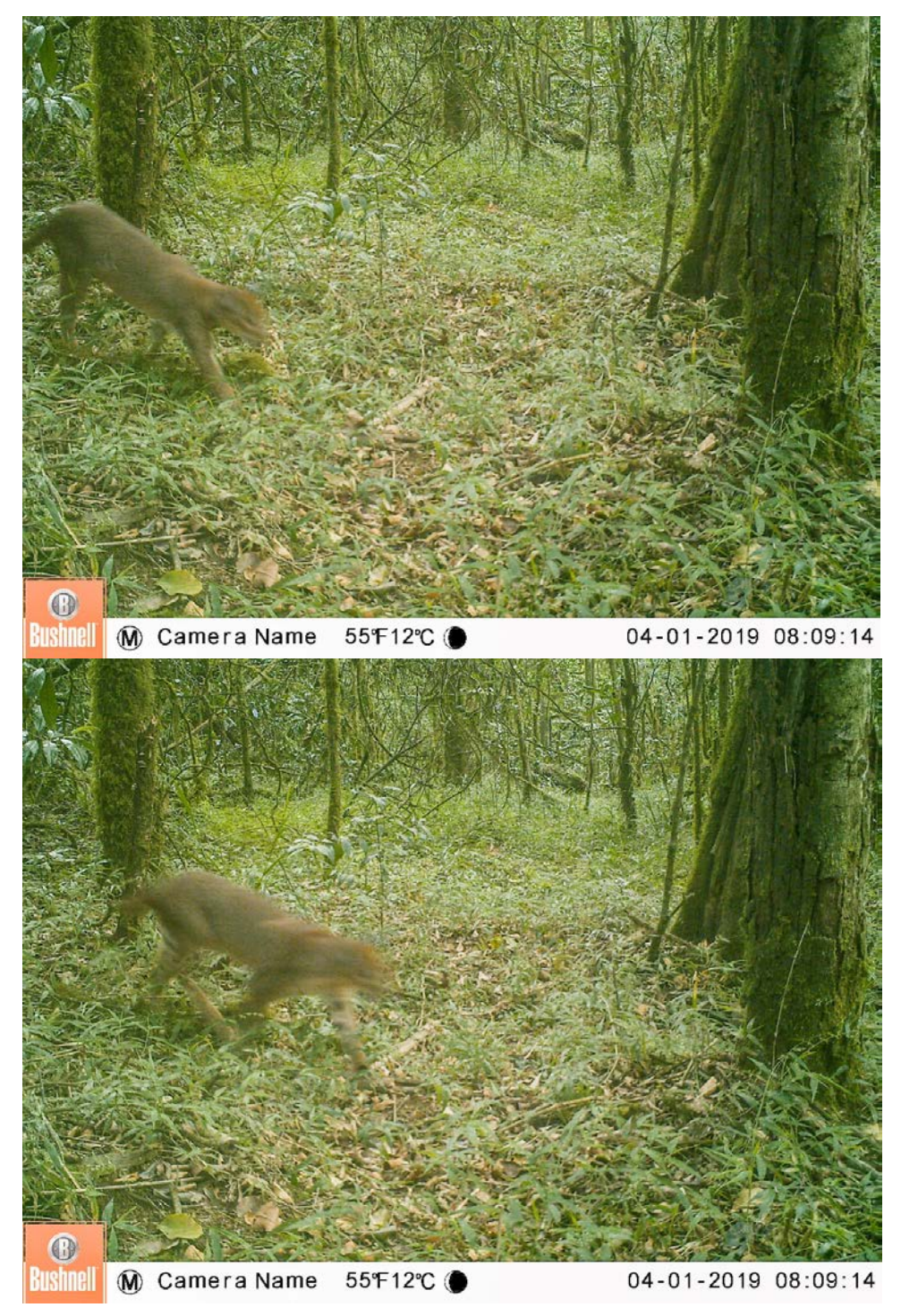
Figure 5. Camera trap images from Kieni Forest Reserve, Kenya, of a cat closely resembling an African golden cat Caracal aurata. The grey pelage and the prominent spotting on the inner legs are characteristic of C. aurata.