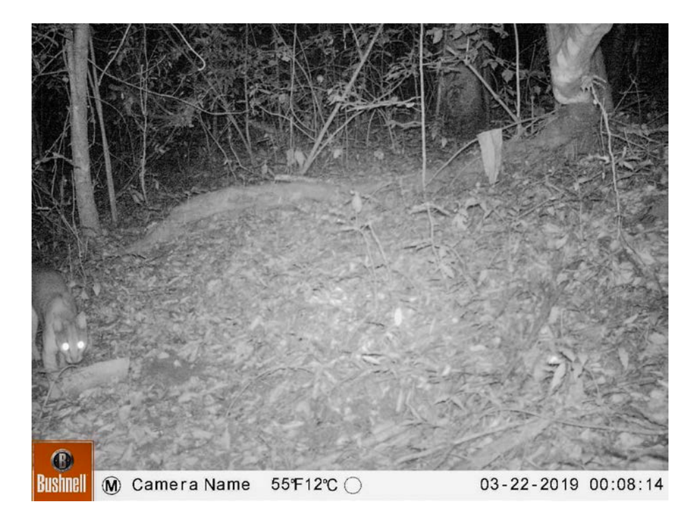
Figure 4. Camera trap image from Kieni Forest Reserve, Kenya, of a cat closely resembling an African golden cat Caracal aurata. The small, round ears that lack tufts are characteristic of C. aurata.