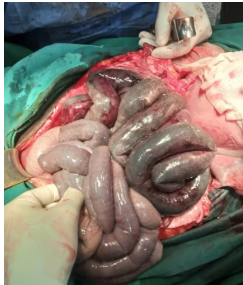
Figure 1 Initial appearance of bowel after midline exposure

She was discharged on POD 13. She was reviewed twice in the first 30 days after discharge and was doing well. After missing subsequent review appointments, she returned with exacerbation of the short bowel syndrome. She was moderately dehydrated and had lost 9.3kg of weight.