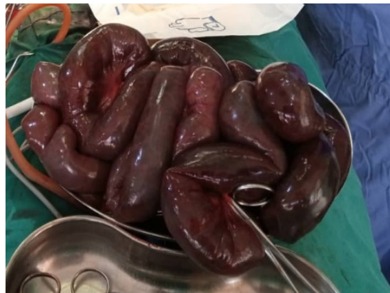
Figure 3 4.6m of non-viable small bowel resected