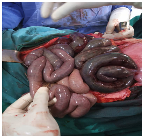
Figure 2 Portions of small bowel regaining some perfusion after de-torsion and division of strangulating bands