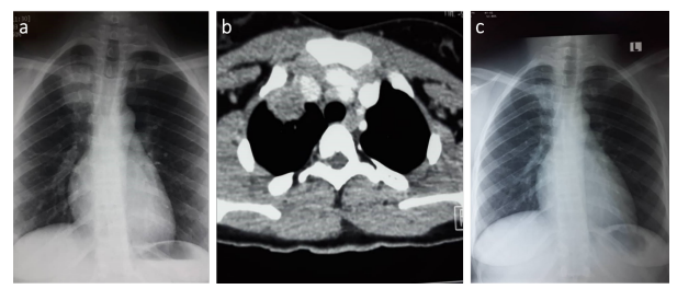
Figure 1 Radiological images for Case 1

There was no associated mediastinal lymphadenopathy. Microscopic examination of lung tissue obtained via CT guided biopsy showed diffuse chronic inflammatory changes with multiple small necrotizing granulomata and interstitial fibrosis consistent with tuberculosis. Standard anti – tuberculosis treatment was initiated and resulted in complete resolution of the lesion as well as her symptoms (Figure 1c).