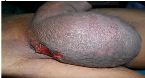
Figure 2 Scrotal hematoma

The patient was given an initial dose of tetanus prophylaxis, analgesia and started on antibiotics. An informed consent was obtained for surgery, which was done under general anaesthesia. The findings at surgery were a right scrotal hematoma with swelling (Figure 2), an area of skin necrosis and a metallic foreign body (Fig 3).