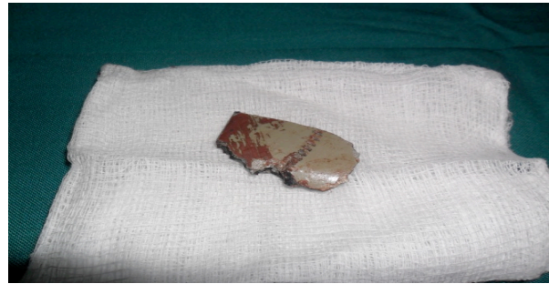
Figure 3 Metal piece removed from scrotum

An incision was made over the right scrotal area and the hematoma was evacuated. A 4cm x 6cm rectangular piece of metal was removed from the deeper scrotal layers (Figure 3). The rectangular piece of metal could be part of the engine block. The lacerated testicular vessels were ligated and an ischemic but viable testis was seen hanging on an intact vas deferens and its vessels. The testis was preserved, a drain was left in situ and the laceration was closed in two layers. The estimated blood loss was 100mls.