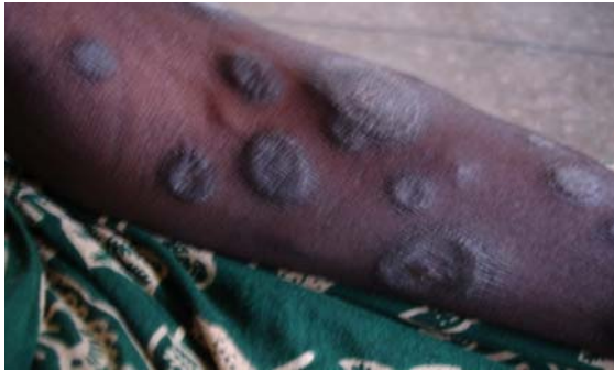
Figure 1 Arm lesions

Differential diagnoses of granulomatous candidiasis, tinea nigra or cutaneous tuberculosis were considered.