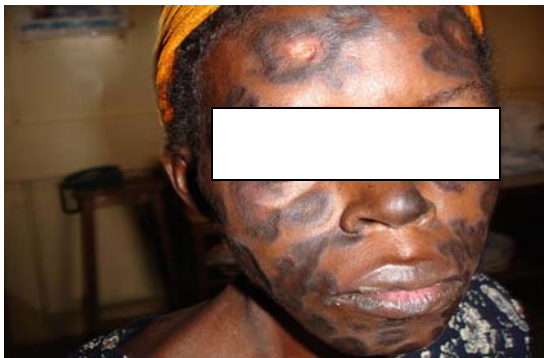
Figure 2 Facial lesions

Punch biopsies of the lesions were sent for histology at the pathology laboratory of the Korle-Bu Teaching Hospital. Histology which showed intradermal and subcutaneous aggregates of lymphocytes and plasma cells as well as many free small cells, ovoid to round in shape identified as leishmania and confirmed with geimsa staining. Few of the organisms were within histiocytes. (Figure 3) The features are in keeping with cutaneous leishmaniasis.