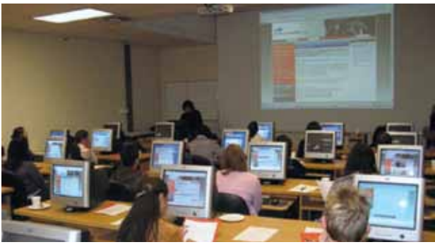
Workshop participants evaluate case study material. Participants of workshops come from tertiary teaching hospitals within South Africa and include interns specialising in paediatrics, pathology, and internal medicine.

site (see the first figure). The rationale behind this approach is that case studies from, or closely related to, real situations are effective learning tools (4). The case-study approach is a form of experiential learning; it integrates practice, knowledge, and skills that further equip clinicians in their professional work (5). As the user reads through the case study on the site, dividing the case study into stages in separate windows, the user is challenged to think about and predict a possible diagnosis based on the clinical evidence he or she has just read. This process is similar to the way a clinician might operate on the job, and the approach fosters lateral and critical thinking, as well as self-guided learning (6).