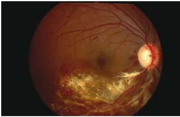
Fig. 2. CMV retinitis after six intra-ocular ganciclovir injections. Note scarring in the area of previous necrosis. There is less vitritis, and the macular oedema has resolved. Haemorrhages may take months to resolve, and intraretinal gliosis can usually be seen late (courtesy Dr Linda Visser, University of KwaZulu-Natal).

CMV of the neurological system. 6 Encephalitis presents with headache, subacute personality changes, decreased concentration, and progressive dementia. Transverse myelitis may occur. CMV is a recognised cause of acute inflammatory demyelinating polyradiculopathy (Guillain-Barré syndrome), the hallmarks of which are rapidly progressive ascending and often asymmetrical paraesthesiae, sensory loss and areflexia, as well as urinary retention, constipation and incontinence. The cerebrospinal fluid may demonstrate polymorphonucleocytosis and raised protein, and the diagnostic method of choice is polymerase chain reaction (PCR) testing of the cerebrospinal fluid for CMV DNA.