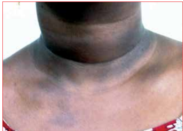
Figure 3: Acanthosis nigricans, neck grade IV. Pigmentation encircling the neck, and visible when facing the subject