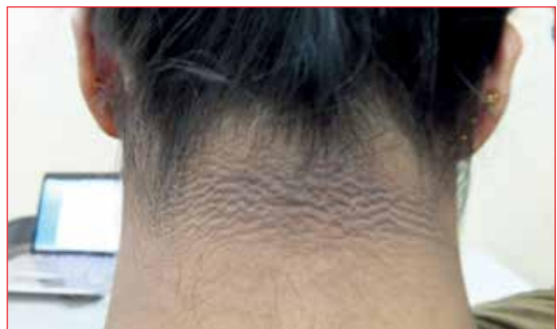
Figure 4: Acanthosis nigricans, neck grade II. Pigmentation at the base of the neck, texture IV. There are visible "hills and valleys" on the pigmented skin

and low-grade AN. The ROC curve nears the upper-left corner of the grid when there is higher sensitivity. From Figure 1, we derived that there was higher sensitivity with regard to the grades, and higher specificity for the acanthosis nigricans textures, when diagnosing IR.