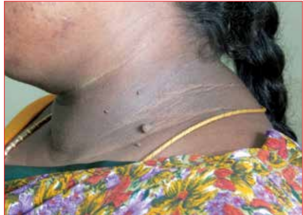
Figure 2: Acanthosis nigricans, neck grade III. Pigmentation on the lateral aspect of the neck, extending up to the posterior border of the sternocleidomastoid muscle