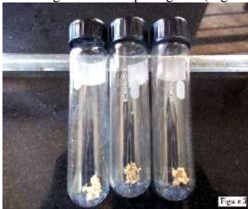
Figure 3: Isolated Protein of THB strain

The mass cultivated broth was filtered by using filter paper. 300ml of filtrate was mixed with 300ml of ethyl acetate in a separating funnel to extract bioactive compounds. After removing the lower aqueous phase, the upper solvent phase was concentrated in a vacuum evaporator at room temperature for 24 hours and a crude extract was obtained. This crude extract was used for further secondary screening studies against human pathogens. (Figure 3)