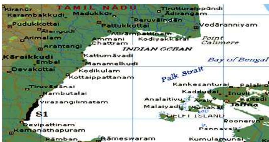
Figure 1: Thondi region: Location and study sites. Part named S1 represents the coastline where samples were collected

Thondi is a small village situated in the Palk Strait region of Tamil Nadu. The study area lies in the latitude of 99°44'N and 79 10' 45" E (Fig. 1). The rainfalls in Thondi region are mainly due to north east and south west monsoon. Thondi coast has very minimal wave action. Turbidity of the seawater is moderately low and also they are rich in nutrients hence, it serves as a treasure house for valuable marine resources like sea grass, seaweeds, and invertebrates like coelenterates, echinoderms and shell fishes (George et al. , 1997). The major occupation of the people is fishing.