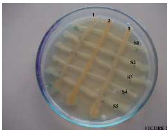
Figure 2: Cross streak Assay against UTI Pathogens 1: Vibrio sp. , 2: Streptococcus sp. , 3: Pseudomonas sp. , S1 – S5 are THB strain isolates

Using a clean sterilized inoculation wire loop, the isolated UTI pathogen ( Vibrio sp. ) was looped and streaks were made on nutrient agar media plate and there after using another sterile inoculation loop take THB strain isolate and streak against the streaks of the UTI pathogen. This was repeated on other nutrient agar plates using the other UTI pathogens ( Pseudomonas sp. and Streptococcus sp. ) (Fig. 2) and the results were tabulated (Table 1)