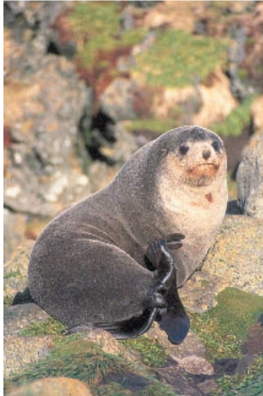
Populations of Subantarctic (left) and Antarctic (right) fur seals have increased at Prince Edward Island