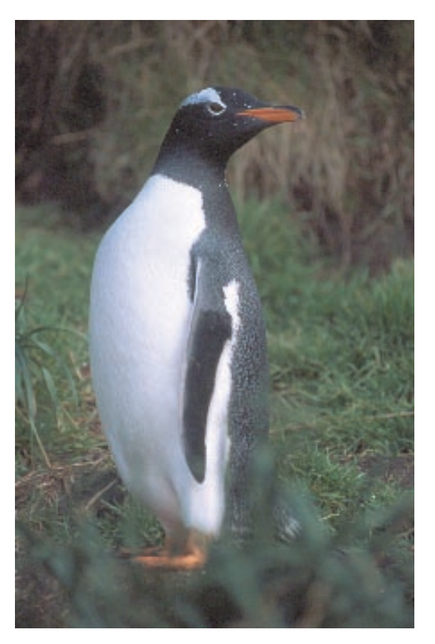
A gentoo penguin at Marion Island