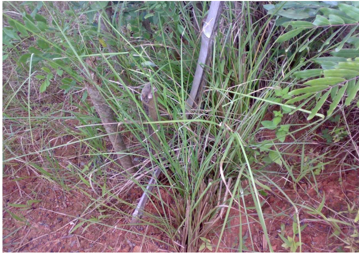
Plate 1: Plate showing a barrier approach using vetiver, bamboo strips, stones and Gliricidia sepium at the block one southeast (2yr old site under reclamation) at AngloGold Iduapriem mine Ltd, Tarkwa

crops are raised. Seedlings of Acacia magium , Gliricidia sepium , Leucaena leucocephala and Senna siamea from the nursery are planted in a specified order. The tree planting is followed by field maintenance where pruning, weeding and fertilizer application are done.