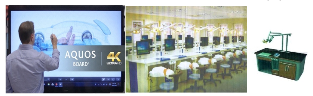
Fig. 4: E-learning enhanced simulation laboratory with interactive smart board, computerized simulation laboratory and teacher's simulation station with voice and video recording facility.

relevant government units need to source for funds for the training of young lecturers/researchers in dental material science. Obviously if the faculties of dentistry are to successfully transit from 'drill and fill' dentistry to minimum intervention dentistry, their simulation laboratories will need to be upgraded with modern ICT facilities with Teacher's simulation station (with voice and video recording facility) and interactive smart boards for e-learning. Fig 4.