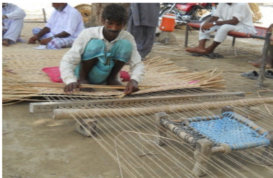
Plate 2: A person making mat from Typha plants

Other than these medicinal values, aquatic plants play an important role in water bodies, as they are the main source of food for zooplankton as Gheese and ducks eat Lemna , Potamogeton , Polygonum species etc. Songbirds use fibres of Typha species to make their nests. Typha plants are also used in making baskets and mats ( Plate 1 and 2 ). Aquatic plants provide shelter to small animals such as aquatic insects, crustaceans, snails etc., that are ultimately used by fishes and waterfowls as food. They are also a source of food for young frogs, salamanders and fishes. Young fishes and amphibians use aquatic plants as cover in protecting them from their predators. They protect shorelines from erosion and alleviate