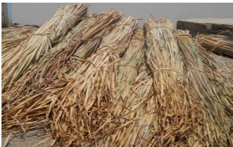
Plate 1: Bundles of Typha plants collected for making mats and baskets

On the basis of above mentioned data, it looks as if Punjab was vastly diversified in having wild aquatic medicinal plants that are being used in Gastrontology (66%), Neurology and Cardiovascular diseases (28%), Respiratory diseases (39%) and Dermatology (17%) in Fig 01. In Punjab, most of the inhabitants have a rural background with an extensive experience in folk medicines as local herbalists and healers. It can be eagerly sought out after the present research work that wetlands of Punjab comprise a significant medicinal flora. The present ethnobotanical survey of aquatic plants of Punjab demands that the ethnopharmacological activities of these plants should be evaluated to support the efforts for the improvement of pharmaceutical industry in terms of natural drug resources for the synthesis of new drugs, that can be very effective against resistant pathogens. This can also lead to the protection of these plants especially from threatening and endangering factors. Most of the young people do not know about such ethnomedicinal uses of the aquatic and semi aquatic plants.