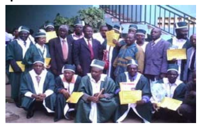
Participatory Training initiative by the Millennium Ecological Museum (MEM) on basic therapeutic techniques and good preservation practices