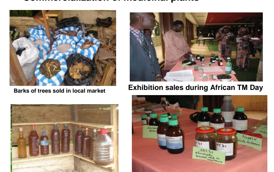
medicinal plants bottled for sale