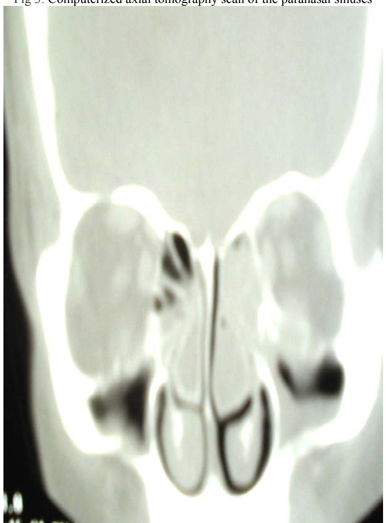
Fig 3: Computerized axial tomography scan of the paranasal sinuses