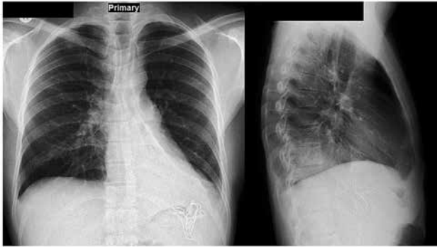
Figure 1: Admission CXR showed partial left lower lobe collapse and loss of clear outline of the left hemidiaphragm, with a pleural collection.