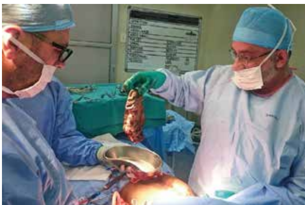
Figure 3: Abdominal swab being removed from chest.

Initially, ventilation of both lungs through the tracheal lumen proceeded without difficulty, but over the 30 minutes' post-intubation it became increasingly difficult, requiring increasing airway pressures. Progressive distension of the abdomen was not relieved by the nasogastric tube. The thin-walled abdominal incisional hernia visibly ballooned outwards, and oxygenation began to decrease. Copious quantities of blood-stained secretions were drained from the endobronchial tube.