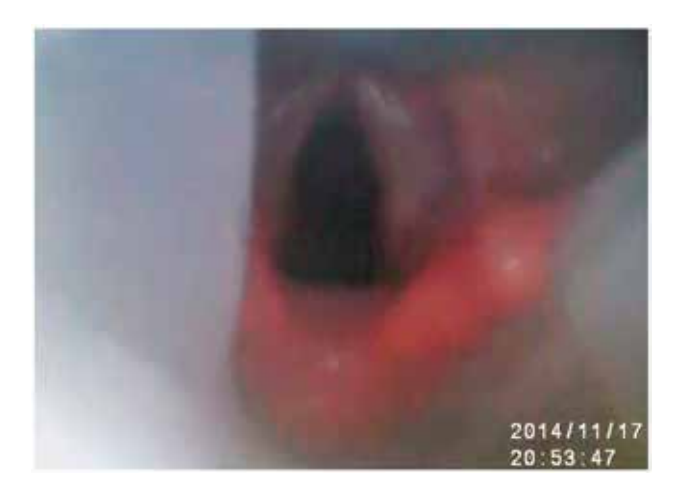
Figure 2: Laryngeal view with totaltrack in situ.

Once optimal view of the glottis was obtained, the pre-loaded tracheal tube (standard Mallinkrodt or Rüsch tracheal tube, internal diameter 7.0 to 8.0 mm, as supplied by the hospital) was advanced through the glottis. Time for intubation was measured from time of optimisation of glottic view on the Videotrack<sup>®</sup> to