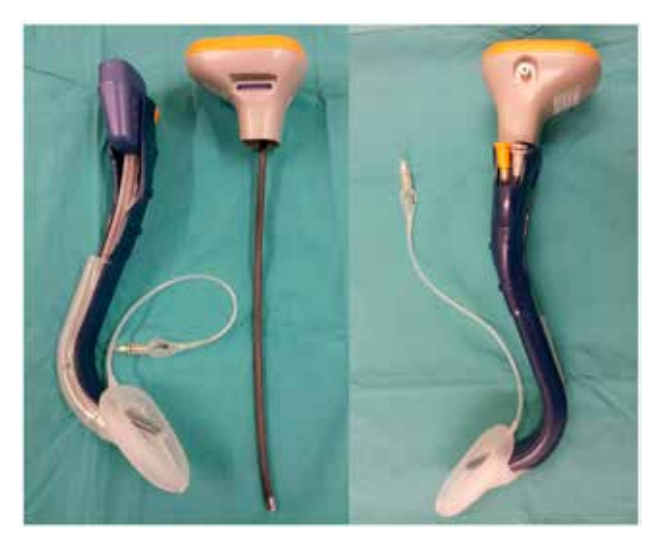
Figure 1: TotalTrack VLM<sup>®</sup> and Videotrack (left), and device ready for use (right).

Departmental and institutional ethics approval were granted by the University of Cape Town Human Research Ethics Committee. Three investigators with more than 5 years' experience in anaesthesia received training in the use of the TotalTrack<sup>®</sup>.