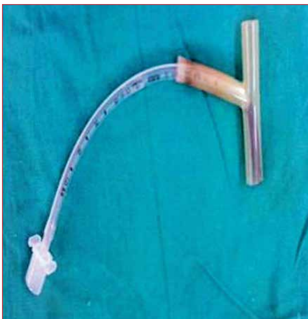
Figure 2: Final position of the distal end of the endotracheal tube through the Montgomery® T tube

With the patient on spontaneous respiration, a 5 mm internal diameter uncuffed polyvinyl chloride (PVC) endotracheal tube (ETT) was introduced through the extraluminal limb of the Montgomery® T tube, with the bevel of the tube facing the trachea (Figure 2). The ETT was inserted until resistance was encountered with the tip of the ETT positioned against the Montgomery® T tube wall. The ETT that was introduced through the short limb of the Montgomery® T tube was attached to the anaesthesia machine.