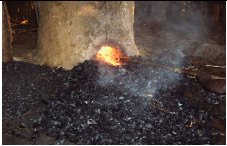
Fig.7: final stage of delivery through the faaliga bottom aperture

The master smelter breaks down the hanging bloom using wooden hoe. After it is dragged to the front aperture ( faaliqa ) of the furnace, the smelters pull it out. The next step is to use the climber ( hidda ) which is used to drag it (Fig.8) through the front door of the smelting house to the garden in front of the house. Here, smelters inspect closely on the productivity of their work. The first level of separating the impure from the pure iron is made. The slag ( balxii ) is beaten off. Fragments of bloom are collected. In the past, marketing used to begin at this juncture although iron ore was also traded across the region. This is the marketing of a semi-cultural material, the bloom ( Dilalii ). Dilalii ( Callaa ) is used to represent the pure grain after it is cleared of the chaff. In this, the Oromo used the parallel meaning of terms in agricultural production for iron smelting. It is true also with furnace, which they know as Gumbii or granary (see Burka 2011 for parallels between furnace and granary).