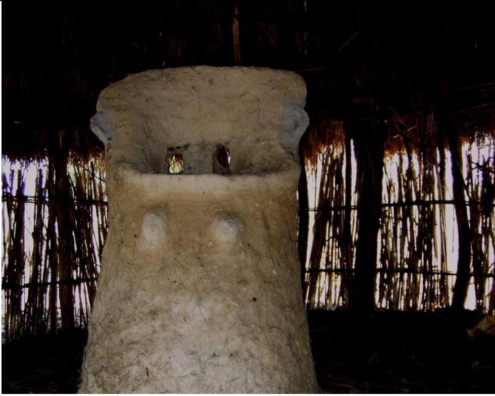
Fig.2: furnace superstructure from southwest Wollega, a front view

In this paper, this pit furnace lacking above ground extension does not convey any form of social value as opposed to the one in southwest Wollega (Figure 2.). Therefore, I will in the following present and emic perspectives of the second furnace popular in southwest Wollega. Iron smelters /smiths in southwest Wollega around Ayra-Gulliso employed a rather splendid type of iron smelting apparatus (Burka 208, 2011, 2013) with decorative additions conveying various socio-cultural messages.