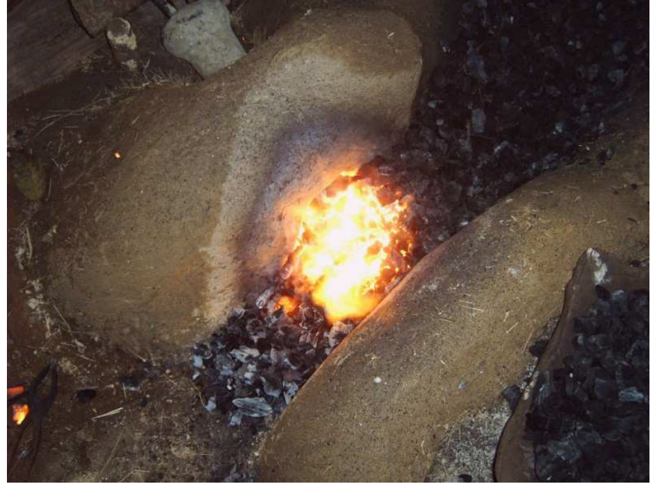
Fig.9: bloom at bubbling stage in the smithing forges in southwest Wollega