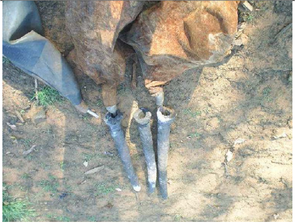
Fig.5: the three components of tuyères and the bag bellows

Furnace has also other components than those parts specified earlier. In iron smelting, air (oxygen, carbon dioxide, carbon monoxide) is an important catalyst-injected either naturally or by forced draught through apparatus (tuyéres) fitted to the furnace. The Oromo tuyères (both in northeast and southwest) are made up of three categories- clay, metal, and horn (see Fig.5; see also Burka 2006, 2008, 2011). The clay tuyères are called penis ( Qunxorroo ) whereas the two bag bellows made from goatskin connected to each tuyère are termed as his sacks ( qalqalaisaa )- meaning the testicles. The clay tuyère is named Madabii /Qunxorroo ), the metal tuyère is termed as Kololii and the horn tuyère is called buudaa . Their physical location and size is as follows: the madabii clay tuyère is the tallest and is inserted fully into the furnace; the kololii metal tuyère is fitted into the horn permanently and is a connecting tool between the horn tuyère and the clay one. The horn, buudaa tuyère is permanently attached to the bellows