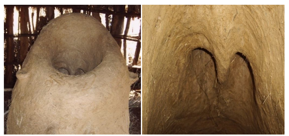
Fig.3: upper part of the furnace head and ear like structure (left) and zoomed-in epiglottis (right)

the movements they make during the pumping process contain symbols humans and objects represent in production activities.