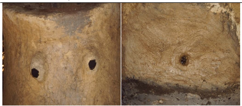
Fig.4: depicts front thorax part of the furnace with breast like structure (left) and a front bottom aperture called faliqa -metaphor for vagina (right).

Below the two breasts, as I explained above, the belly like structure depicts a pregnant woman. As one moves down, there is another opening left close to the ground surface called faaliqa (Fig.4. right) or koshee . This opening is sealed during smelting leaving only a narrow one penetrated with the forefinger of the master smelter, who is the symbolic husband to the furnace woman. One of smelting furnaces at Abayyani of Ayra-Gulliso was named Gobanee (Burka 2008). It is the name of a woman not a man. Literally, Goobanee is derived from the verb goobane , which refers to the time of maturity such as when the moon becomes full meaning Ji'a goobane . I will discuss later on how the selection of the name has something to do with the issue of fertility. While I have attempted to show furnace in iron smelting is a representation of fertile woman, it is important that, as fire is central also in iron smelting, the social meaning and significance attached to fire by the people needs discussion at some length.