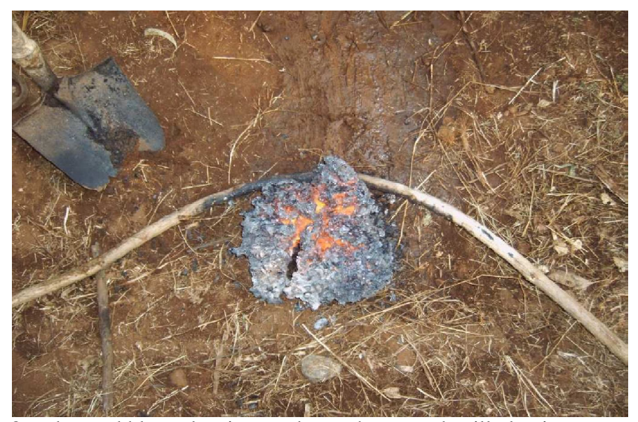
Fig.8: a dragged bloom leaving marks on the ground, still glowing

from affecting his yield, the master smelter also provides similar offerings for different purposes - including abstaining from some `impure` things or actions.