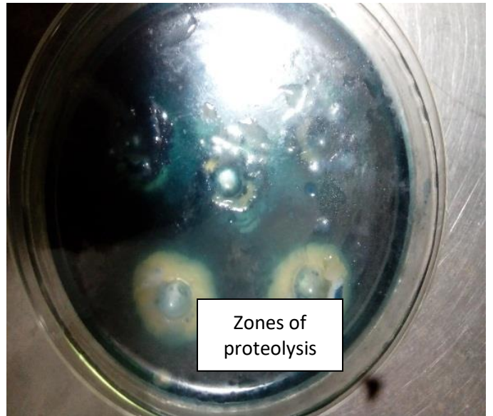
Figure 4.0: Proteolytic activity of Candida albicans . The zones of clearance correspond to the proteolytic activity of Candida albicans