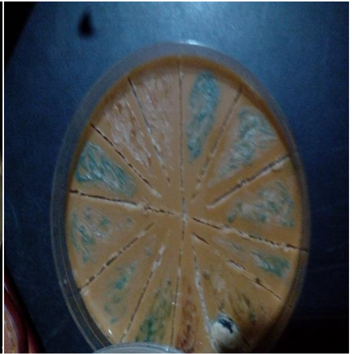
Fig 2.0: showing results of Candida spp growing on chrome agar