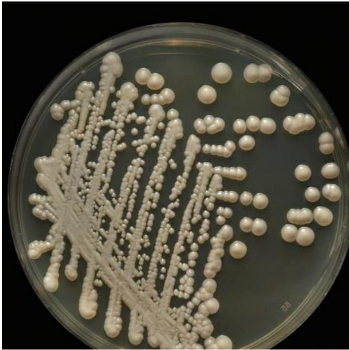
Figure 1.0: Candida spp on SDA culture plate