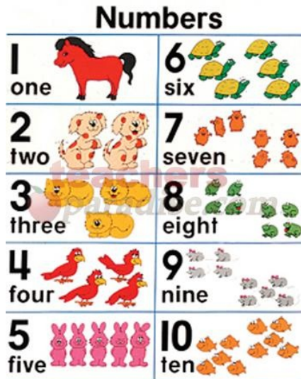
Figure 3 Number chart from a workbook