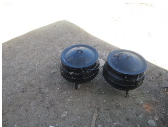
Figure 5 Imbiza: Three-legged pots