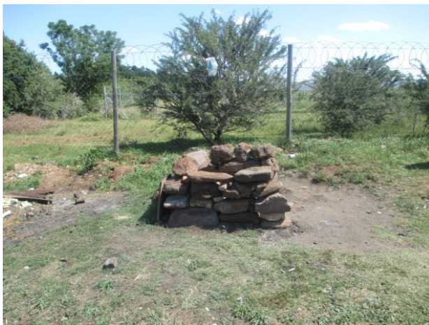
Figure 4 Iziko fireplace enclosure at Cofimvaba

on the other hand, what the teachers have indicated should form part of the content of the materials (Figures 4 and 5). The second set of images recognizes local and indigenous knowledge systems; and ensures that the content is shaped by local contexts to which learners can easily relate.