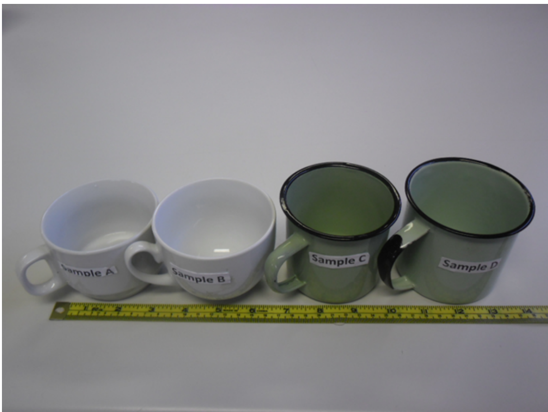
Figure 1: Samples of cups presented to the participants

The sizes, in units of cups, of the four samples presented to participants were established with a measuring cylinder to be 185 ml ( \frac{3}{4} Cup), 250 ml (1 Cup), 330 ml ( 1\frac{1}{3} Cup) and 375 ml ( 1\frac{1}{2} Cup) for samples A, B, C and D, respectively (Figure 1) [5]. In the case of tablespoons, however, there was a limited number of varying sizes of spoons that approximate a tablespoon in the market; therefore, participants were presented with 3 samples in units of Tablespoons measuring 10 ml or \frac{2}{3} Tablespoon (Sample A), 15 ml or 1 Tablespoon (Sample B) and 7.5 ml or \frac{1}{2} Tablespoon (Sample C). Similarly, for units of teaspoons, participants were presented with four samples as Sample A: 1 teaspoon tsp or 5 ml, Sample B: 1\frac{1}{4} teaspoon or 6.25 ml, Sample C: \frac{3}{4} teaspoon or 3.75 ml, and Sample D: \frac{2}{3} teaspoon or 3.5 ml.