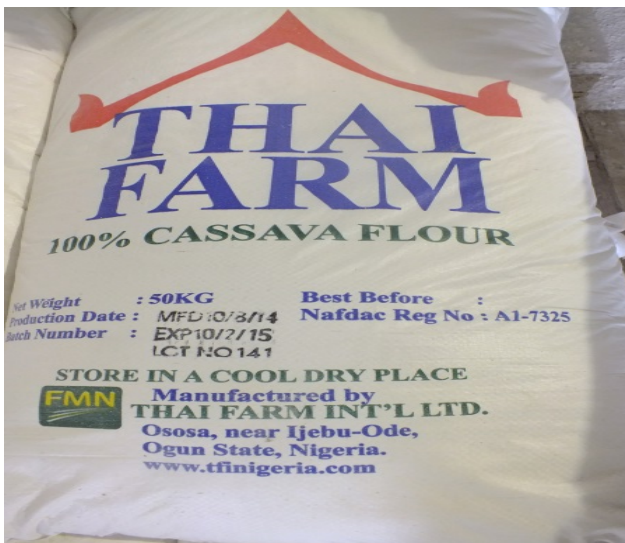
Figure 3: High quality cassava flour produced in Nigeria

For instance, in Uganda a private entrepreneur (Adyaka Farms in Lira) who had been processing his cassava mash into HQCF through sun drying was encouraged and supported to purchase a flash drier. Prior to the acquisition of the more efficient drier, his monthly HQCF production was an average of 8.8 tons. Upon the commissioning of the drier, his monthly production has increased to 29.6 tons while providing additional employment for 28 people.