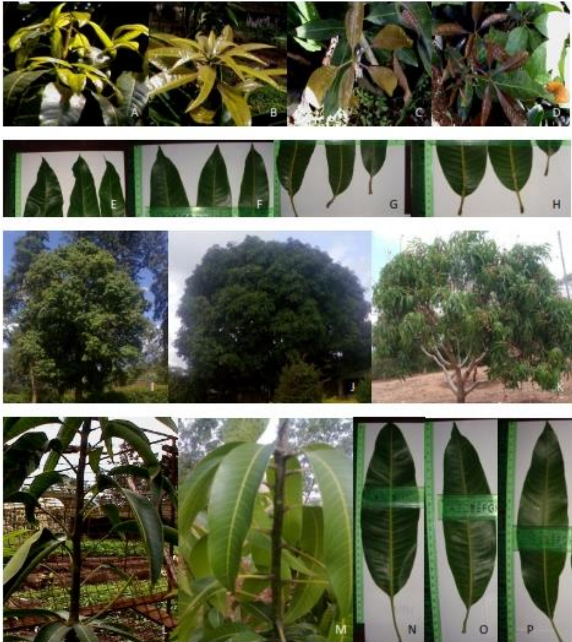
Plate 1: Morphological diversity observed in mango accessions from the UAR region of eastern Kenya. A-D: Color of young leaves (Light green, Light green with brownish tinge, Reddish brown, Deep coppery tan); E-H: Leaf characters (Acute apex with wavy margin, Acuminate apex with entire margin, Acute base, Obtuse base); I-K: Crown shapes (Oblong, Semi-circular, Spherical); L-M: Leaf attitude (Semi-erect, Horizontal); N-P: Leaf shapes (Elliptic, Lanceloate, Lanceolate/Oblong)

The leaves of the mango trees were majorly elliptic in shape (62.8%) with an obtuse leaf base shape (84.9%), an entire leaf margin (77.9%) and chartaceous texture (68.6%). A leaf blade shape not described before by IPGRI was also observed in 33.7% of the accessions.