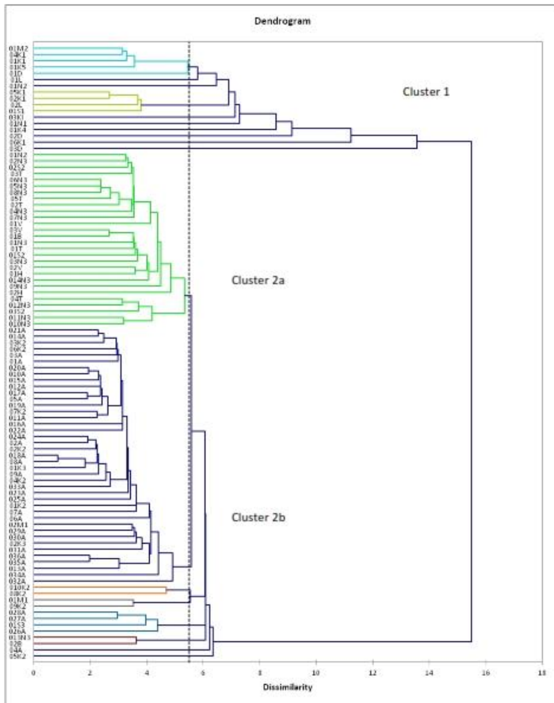
Figure 1: Dendrogram based on morphological characters of mango accessions from the UAR region of eastern Kenya using the single linkage and Euclidian distance

From the PCA, the first six principal components axes took into account 75.12% of the total variance in the studied accessions, with eigen values ranging between +5.238 to +0.975 (Table 6).