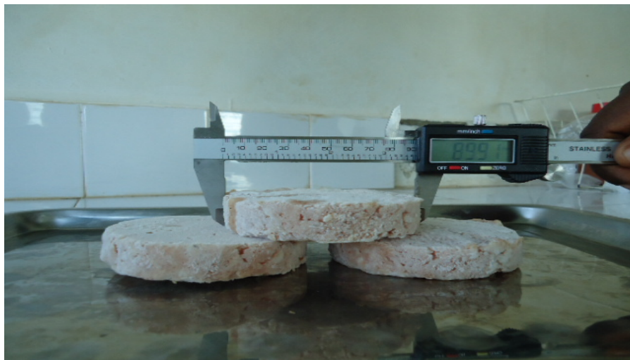
Plate 1: Measurement of Diameter of burgers

The thicknesses and diameters of the products were measured using digital callipers before and after cooking, as shown in Plates 1 and 2 below: