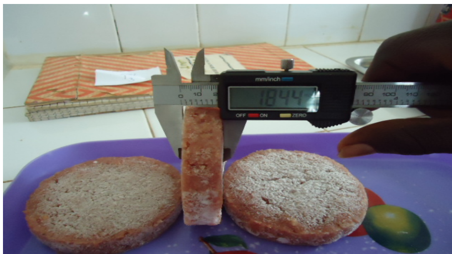
Plate 2: Measurement of Thickness of burgers

The cooked thicknesses and diameters of the individual products were subtracted from the fresh ones to obtain the changes in thickness and diameters (in millimetre).