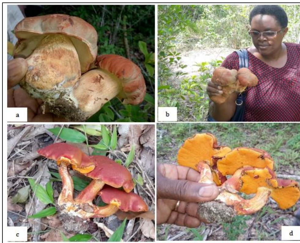
Figure 2: Boletus bicolor locally known as uyoga maini: (a & b) a young fleshy fruitbodies (c & d) Old fruitbodies growing on soil in the remnant of Miombo woodland in Newala district- Mtwara region, Tanzania. (All photos taken by the author).

The study findings established the variation on the portrayed inhibition zones. Lentinus edodes was found having the largest mean clear zone diameter of 2.0 mm followed by Pluerotus ostreatus (1.8 mm) while the least was portrayed by Agaricus bisporus with mean clear zone of (1.6 mm) all relatively less compared to the portrayed inhibition zone of 2.3 mm. Other similar studies were also done by Ramesh and Pattar (2010), Gezer et al. (2006), Mercan et al. (2006) who also came up with the varied activity against the pathogens from different mushroom extracts. From these studies and comparing to this study results, it is clear that different mushroom species exhibit different antimicrobial activity as it has been also noted in Marjana et al. (2012); who also