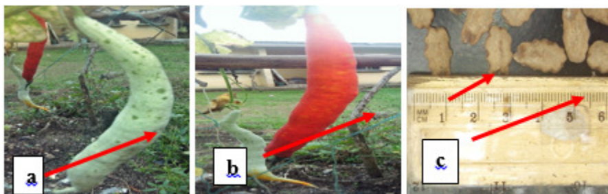
Plates 1(a-c): Trichosanthes cucumerina (a) Young fruit (b) Ripe fruit (c) Seeds

Flavonoids and alkaloids (extraction and analyses): The flavonoids and alkaloids determination using Waters 616/626 LC (HPLC) were carried out in line with the method described by Okonwu et al. (2017).