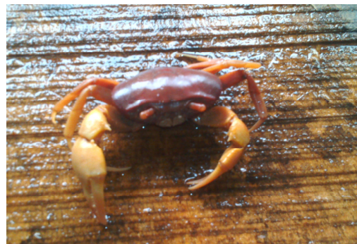
Plate 3: Cardisoma armatum (Land crab)

A total of 107 crabs belonging to five families were recorded. Goniopsis pelii was the most abundant in Station 1 accounting for 57.9% of the percentage abundance, followed by Callinectes amnicola 26.3%, while in Station 2, Callinectes amnicola was the most abundant accounting for 46.6% of the percentage abundance. Station 2 had the highest Shannon diversity index of 1.22, while Station 1 had 1.15 (Table 3).