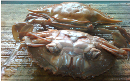
Plate 1: Callinectes amnicola (Swimming crab)