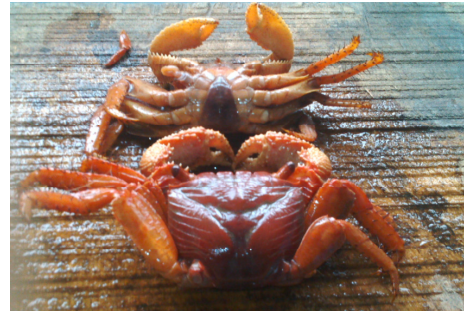
Plate 2: Panopeus africanus