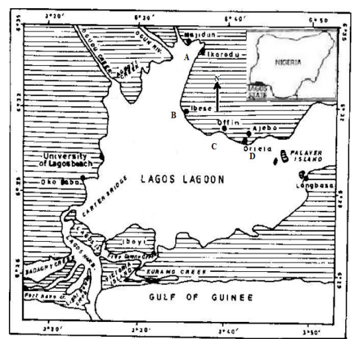
Fig 1: Map of Lagos Lagoon Showing Sampling Stations in Alphabet A, B, C & D