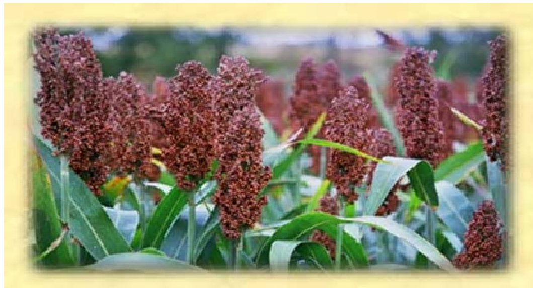
Figure 1. Sorghum bicolor (L.) Moench.

ted sorghum grains are generally used for the preparation of “tô”, porridge, and couscous. Malted sorghum is used in the process of local beer “dolo” (reddish, cloudy or opaque), infant porridge and non-fermented beverages. Starch is the main reserve polysaccharide of the plant kingdom, and the principal source of carbohydrate from agricultural origin, being the end product of photosynthesis. Sorghum grains like all cereals grains are comprised primarily of starch. \alpha -Amylases are endoenzymes that randomly split \alpha -(1 \rightarrow 4)-linkages in starch. \beta -Amylases on the other hand, are exoglucosidases releasing maltose units from starch. The purpose of this review was to overview the current knowledge on the relevance of starch content and the activities of amylases in sorghum food processing in West Africa.