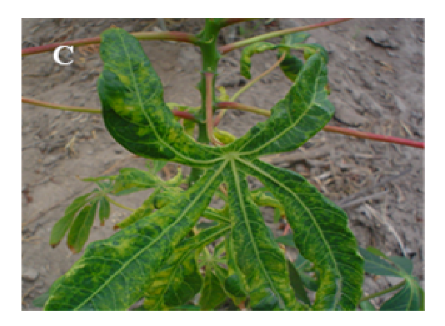
Figure 1. Infection with SACMV (A) Stunting and leaf distortion of tobacco leaves in infected plants (right) and normal looking healthy control (left). Plants were photographed at 28 days post-inoculation (dpi). (B) CMD symptoms on young systemically infected leaves of cassava (right) and young healthy leaves (left). Plants were photographed at 30 dpi. (C) Leaf showing CMD mosaic symptoms in a cassava field in Mpumalanga Province, South Africa.

resistance to SACMV. We believe that biolistic inoculation of SACMV dimer infectious to cassava will expedite screening for SACMV resistance without having to rely on whitefly inoculation, since SAMCV is not mechanically transmissable.