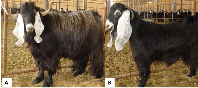
Figure 1. Male of Ardi goat, showing grayish elongated ears, spiral horns, and black coat color (A). Female of Ardi goat, showing grayish elongated ears, semi-circular horns, and black coat color (B).

common native goat populations in the Kingdom are Ardi, Bishi, Jabaly, Hejazy, Najrani and Tohami (Al-Khoury, 1996). Ardi goat is a dual purpose, medium-sized, black colored, well-adapted to arid conditions. The average body weight of the male and female is 51 and 40 kg, respectively (Alamer, 2003; Al-Saiady et al., 2007). Horns are presented in both sexes, where the female's horn is semi-circular while the male's horn is spiral in shape. Ardi has grayish color, elongated and well drooping ears with coarse hairs (Alamer, 2006). Alshaikh and Mogawer (2001) reported the mean birth weight of male and female as 4.29 and 3.63 kg, respectively. Unfortunately, no studies have been found regarding genotypic variability of Ardi goat population in Saudi Arabia. Consequently, studying the genetic diversity of Ardi goat would be an essential step in any conservation and breeding programs of this breed. Therefore, the objective of this study was to evaluate the genetic diversity of Ardi goat in the Central Regions of Saudi Arabia based on microsatellite analysis.