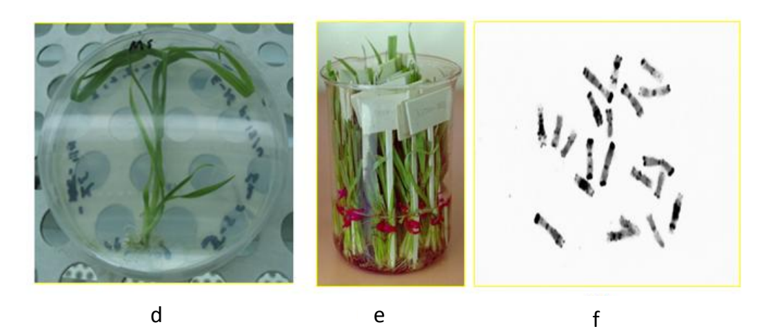
Figure 2. Procedures of wheat x maize wide cross method for doubled haploid wheat production: a = growing maize plants; b= pollinated spikes with maize pollen; c =obtained seed from crosses with maize; d = plant developing from rescued embryo; e = haploid plants under colchicine treatment (0.2%); f = chromosomes counting (Inagaki, 2003).

maize (Almouslem et al., 1998; David et al., 1999; Garcia-Llamas et al., 2004). Recently, Sourour et al. (2012) have reported the production of successful DH durum wheat genotypes using the wheat x maize system.