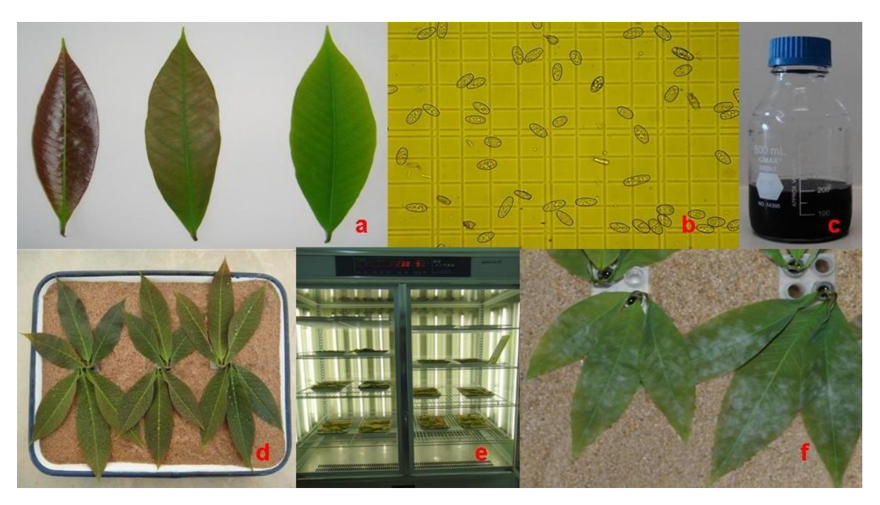
Figure 1 . In vitro culture of powdery mildew ( Oidium heveae ) of Hevea brasiliensis . a, three kinds of phenological phase leaves of bronze, Colour and light green of GT1; b, fresh powdery mildew asexual conidia; c, NS7 nutrient solution; d, Colour phase leaves with nutrient solution in culture dish; e, in vitro culture in climate incubator; f, Colour phase leaves cultured for 9 day of GT1.

consequently aid in its research and improve rubber resistance breeding process. In this study, the influences of 6-benzylaminopurine (6-BA), salicylic acid (SA) and vitamin C (VC) of nutrient solution for in vitro culture were investigated by orthogonal experimental design.