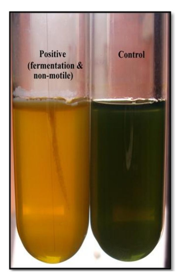
Figure 1. Hugh and Leifson's test and motility test.

(Figure 2). There was no gas production in the Durham's tube.