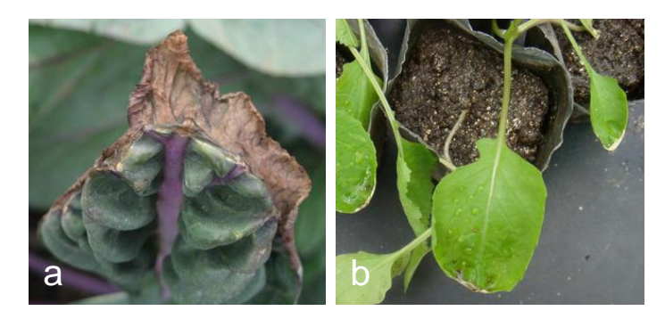
Figure 1. Natural symptoms of Purple-Caitai ( Brassia campestris L. ssp. Chinensis L.var. utilis Tsen et Lee) margin scorch and the symp-toms of Purple-Caitai at 7days post-inoculation. a. Natural symptom. b. Post-inoculation symptoms.