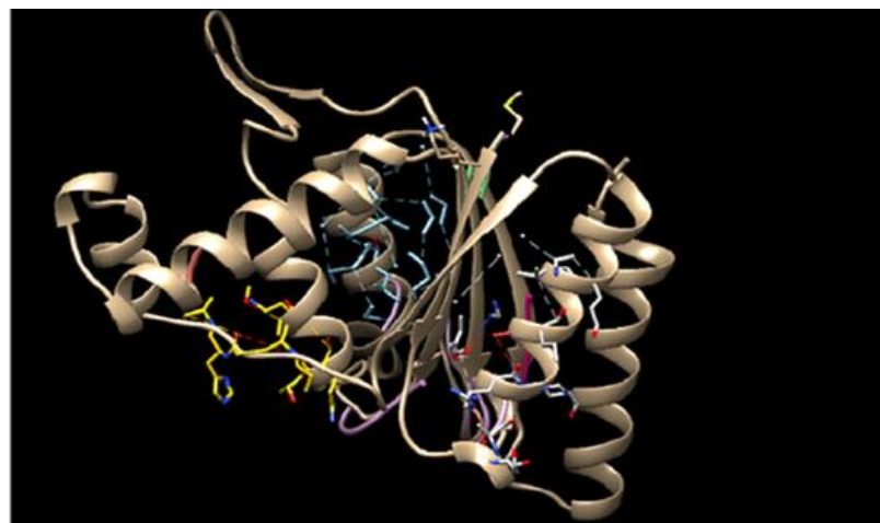
Figure 3. Active sites displayed in three dimensional structure of the azoreductase enzyme predicted with DoGsite scorer and viewed in Chimera.

effluents are a threat to public health because of its high toxicity and carcinogenicity (Bisschops